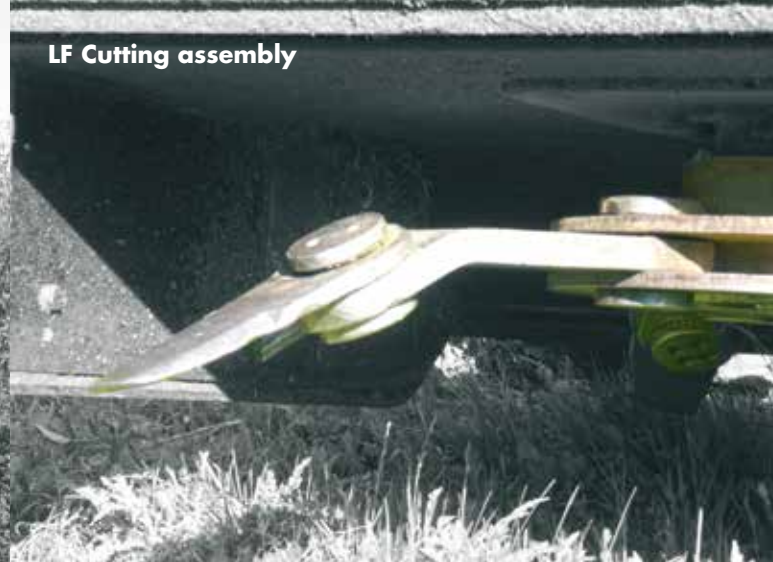
LF Cutting assembly