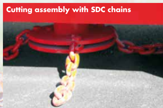
Cutting assembly with SDC chains