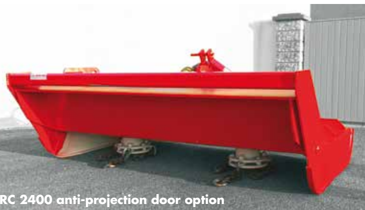
BRC 2400 anti-projection door option

"A choice of equipment that responds to all your needs."