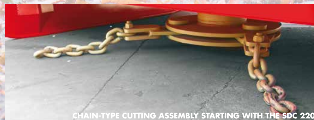
CHAIN-TYPE CUTTING ASSEMBLY STARTING WITH THE SDC 2200