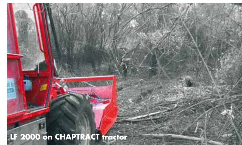
LF 2000 on CHAPTRACT tractor