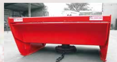
SDC DOOR OPEN