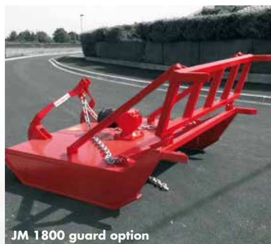
JM 1800 guard option

► The JM range is available with an optional offset coupling.