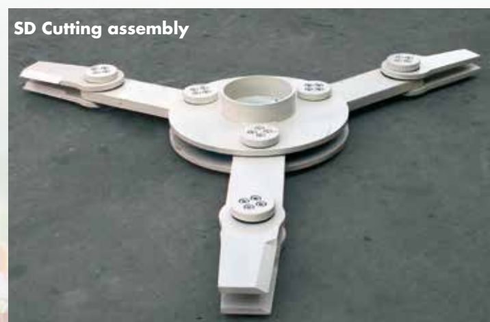
SD Cutting assembly