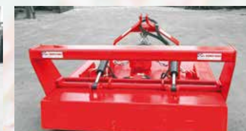
SDC DOOR CLOSED