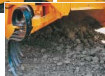
The front drive enables collection over a width of 2.5 m.

The result of leading edge technology, the 3420 is the ideal tool for all work involving stone collection from the headlands or directly in the field.