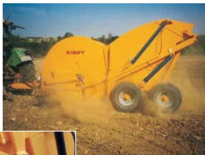
Direct stone removal in a field.