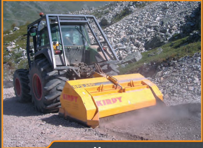
MOUNTAIN CRUSHING WORK: MARKING OUT AND PREPARATION OF SKI PISTES

BPS 300 complies with the increase of power tractors for a maximum of performance.