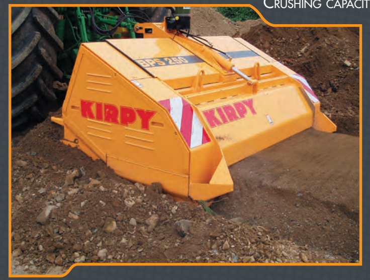
FORESTRY WORK: CREATION AND REPAIRS TO FOREST PATHS OR FIRE BREAKS.

CRUSHING WITH CLOSE ANVIL: CRUSHING CAPACITY: 0/20 – 0/40